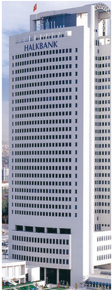
AID: Halkbank will help businesses that encounter cash problems.